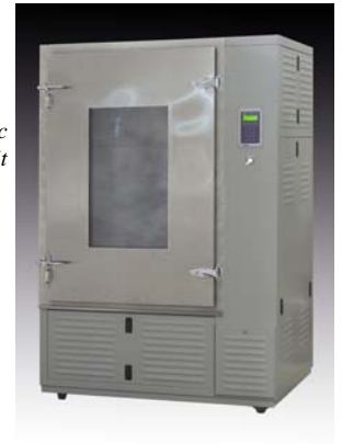
30 cubic foot unit

Controlled Spaces from 4.5 to 1000 Cubic Feet