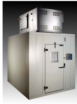
10' x 10' room with 700 CFM conditioner