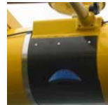
Low Cost Heave Measurement