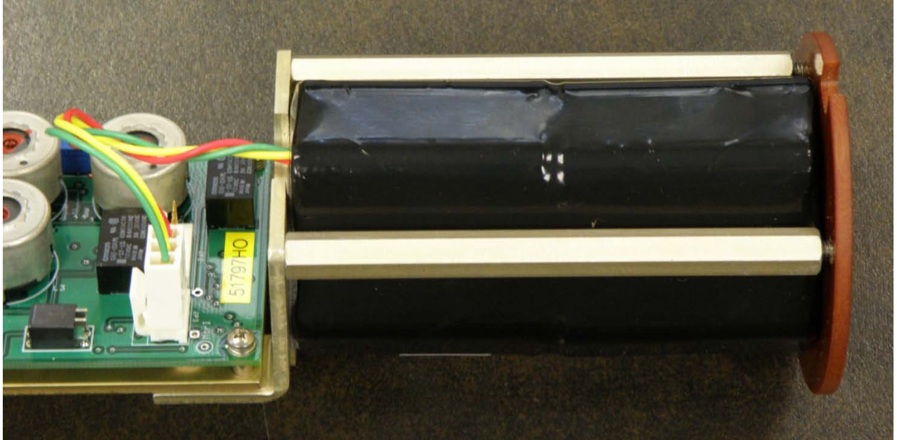
Figure 4 - PCB CONNECTORS